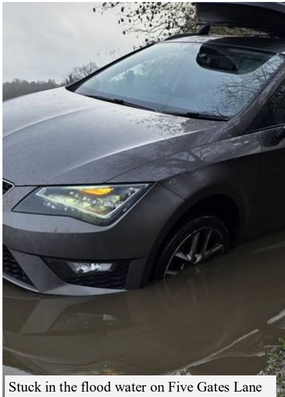
Stuck in the flood water on Five Gates Lane