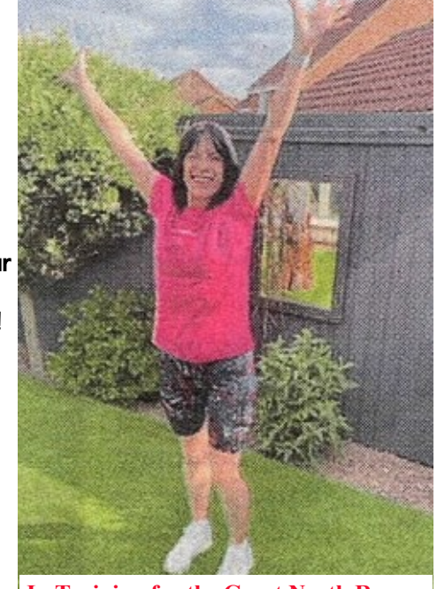
In Training for the Great North Run

There must be numerous people out there who have done great things for our community during these most uncertain of times, please let us know about them! The Council prefers the nominations to come from you the residents rather than a member of the council so please let's all celebrate the great work being done. Qualifying criteria states that whatever they have been doing must have benefitted more than one person and have some involvement within the parish.